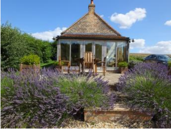
Flag Stone Terrace