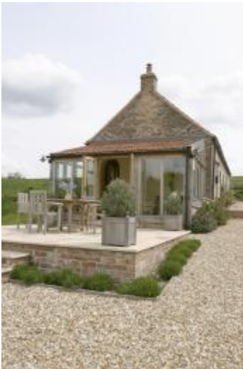
Flag Stone Terrace