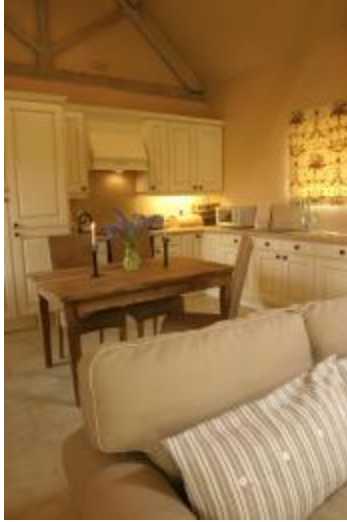
Open Plan Kitchen