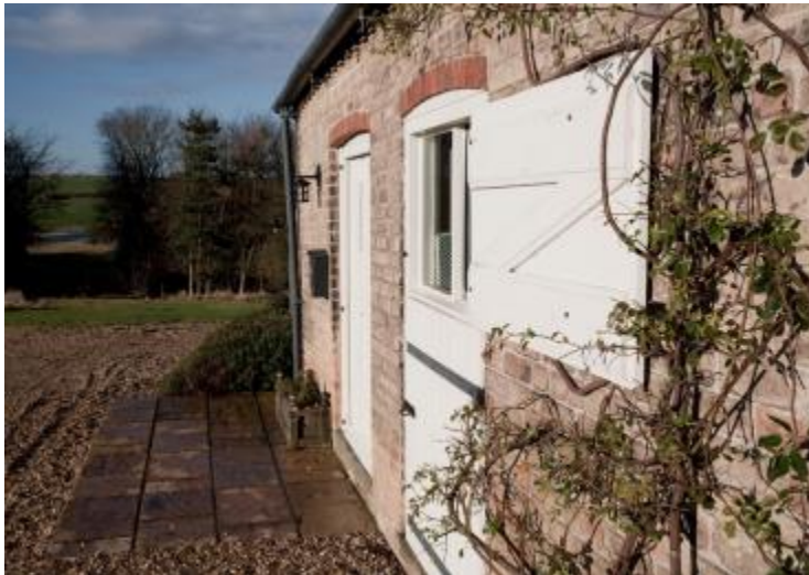
Entrance (Side View)