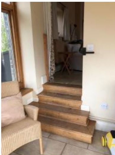
Steps from Sitting Room into Garden Room