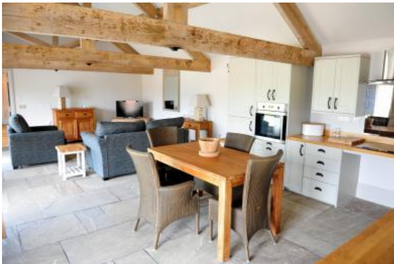
Open Plan Kitchen